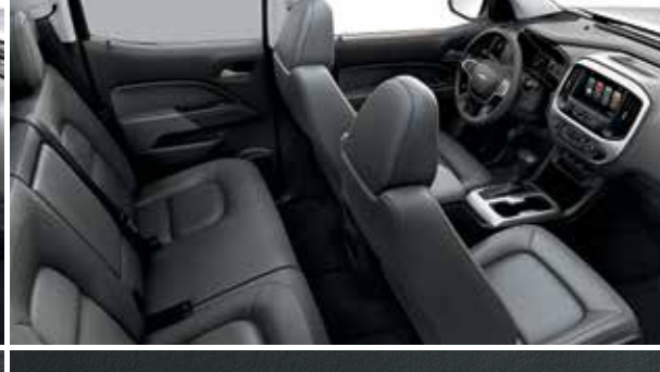
Dark Ash Leather Appointments with Jet Black Accents<sup>11</sup>