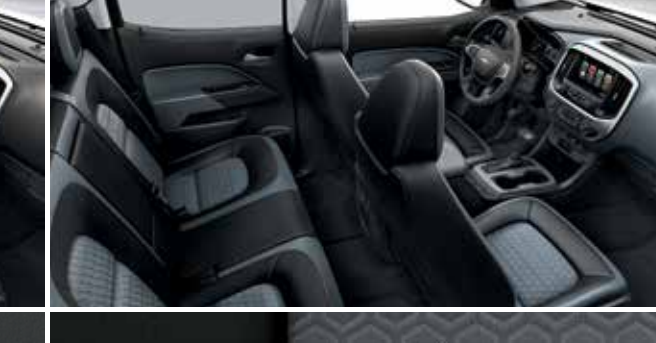
Jet Black Cloth/Leatherette<sup>12</sup>