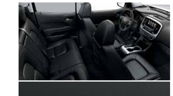
ZR2-Specific Jet Black Leather Appointments with Jet Black Accents