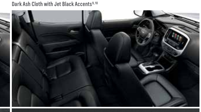
Jet Black Leather Appointments with Jet Black Accents<sup>11</sup>