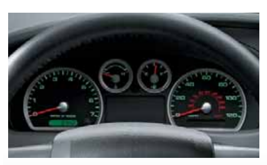
FX4 OFF-ROAD Gauge Group

Comparisons based on 2007 competitive models, publicly available information and Ford certification data at time of publishing. Some features discussed may be optional. Vehicles shown may contain optional equipment. Features shown may be offered only in combination with other options or subject to additional ordering requirements or limitations. Dimensions and capability ratings shown may vary due to optional features and/or production variability. Following publication of the catalog, certain changes in standard equipment, options and the like, or product delays may have occurred which would not be included in these pages. Your Ford Dealer is the best source for up-to-date information. Ford Division reserves the right to change product specifications at any time without incurring obligations.