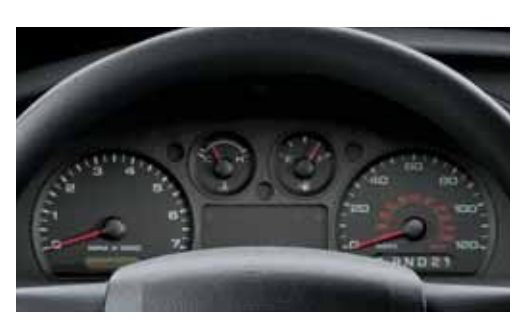
XL Gauge Group