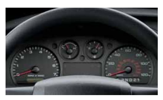
XLT Gauge Group