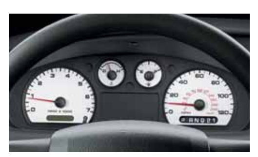
SPORT Gauge Group